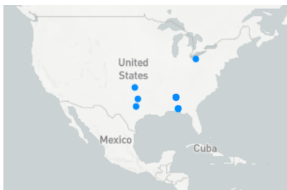
Map to the left represents the six locations assessed and includes six sites in Texas, Ohio, Oklahoma and Alabama.

These scenarios were applied using Sust Global, a geospatial data platform, to measure physical risk exposures at six locations that best represent our real estate portfolio.