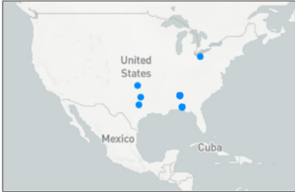
Map to the left represents the six locations assessed and includes six sites in Texas, Ohio, Oklahoma and Alabama.

These scenarios were applied using Sust Global, a geospatial data platform, to measure physical risk exposures at six locations that best represent our real estate portfolio.